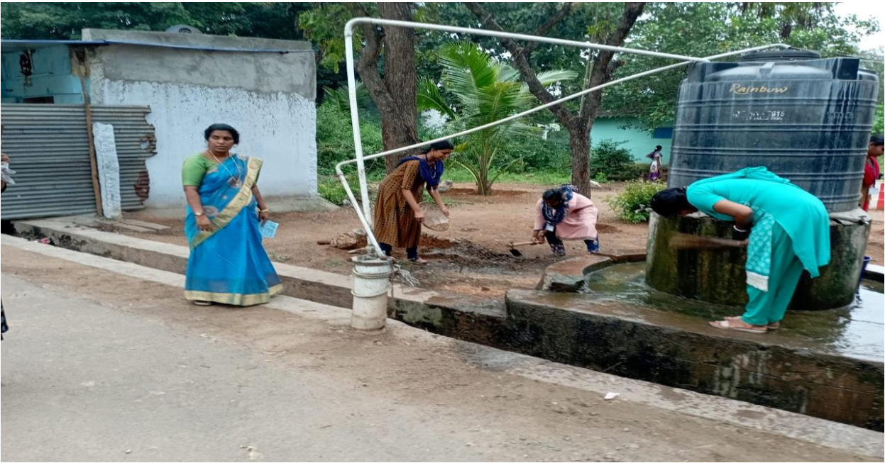
Cultural Activities – 08.12.2022

At 6.00 pm Kurinji Kuzhuvinar of NSS volunteers organized cultural programs such as group songs related to the conservation of environment, skit on clean India etc.,