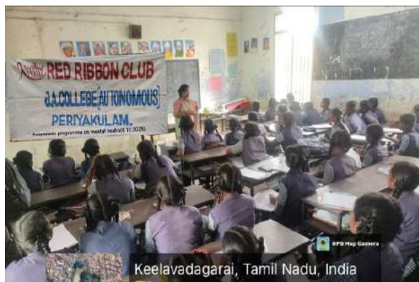
Keelavadagarai, Tamil Nadu, India