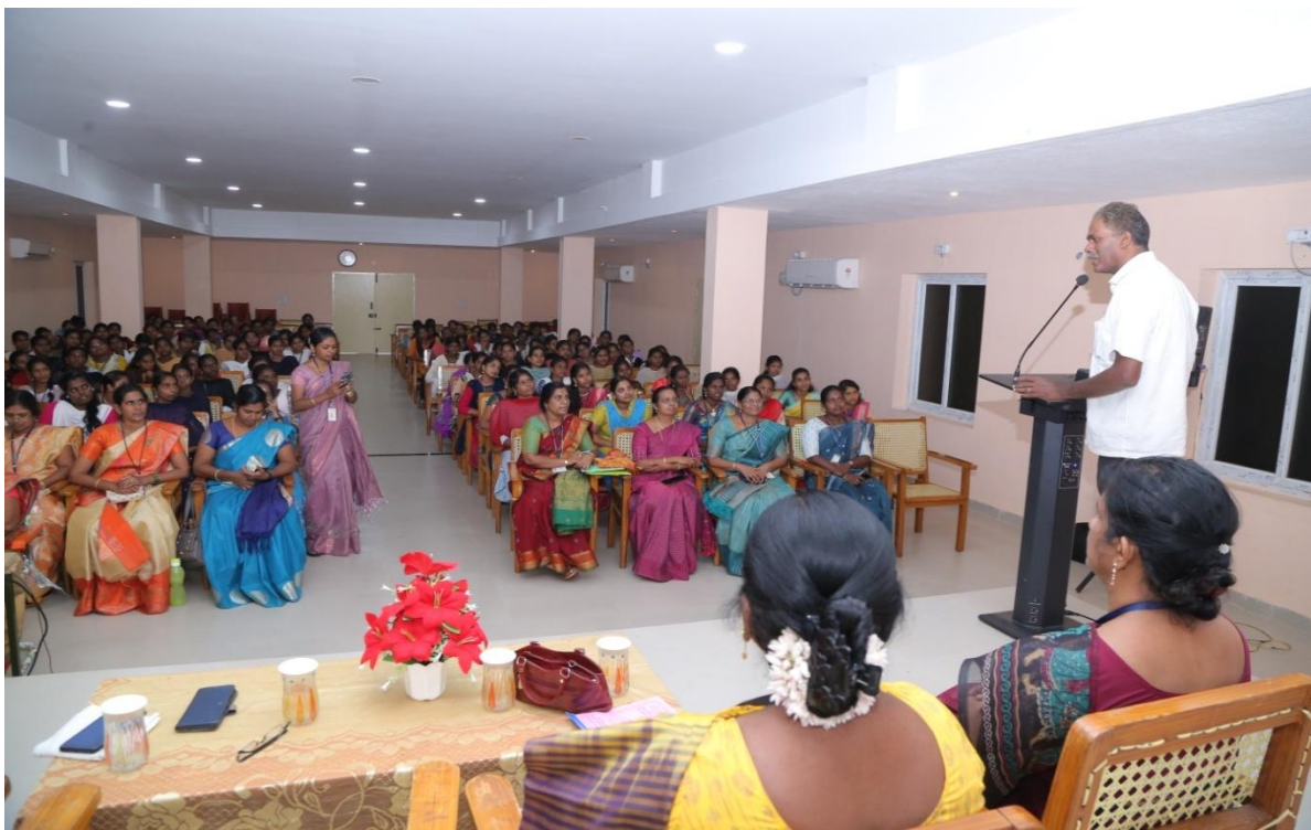
HOMEMADE CAKE PREPARATION