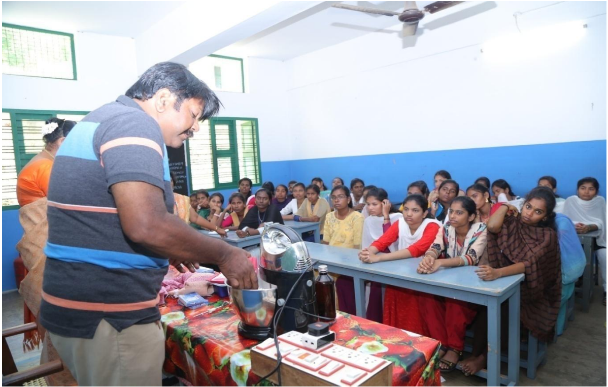
NATURAL GLOWING COSMETIC POWDER, SPICY POWDER AND DHOOP INSENCE PREPARATION