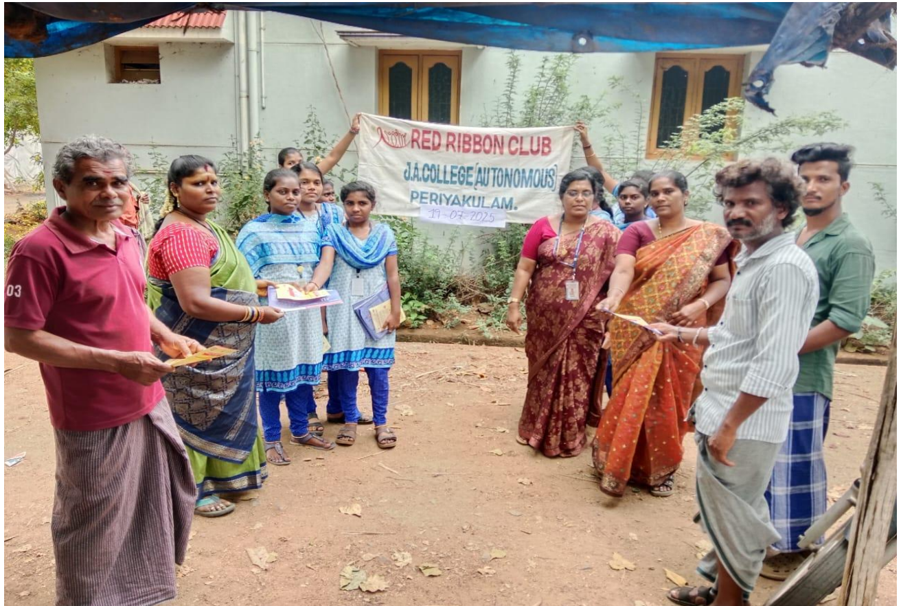
students were involved this program. Two village people were benefits through this awareness program